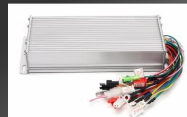
Controller TP power