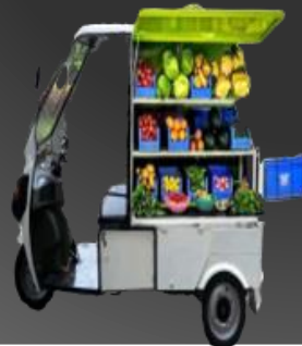
FREEDOM SABZI CART