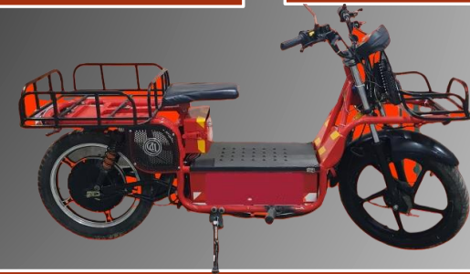
Macho Series (Macho M 200)