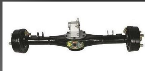
Differential 10:1 gear ratio